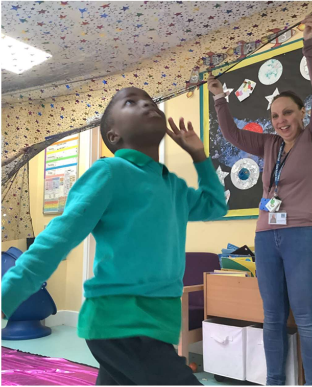
We enjoy our sensory story each week especially the orbiting space lights.

In our bucket sessions we have been making a moon potion like the witch in the story ready to zoom off to the moon.